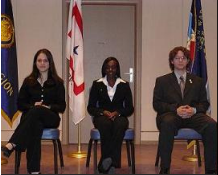
Department Oratorical Finalist 2008