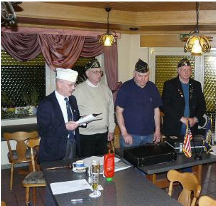
GR 14 Meeting and Elections February 13 2008