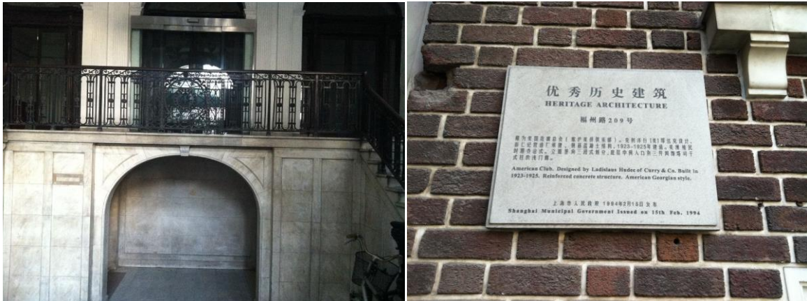
Shanghai American Club Interior and Shanghai American Club Plaque

The American Legion will be celebrating its 100th anniversary in 2019, and there is a push within the Legion to establish provenance for their posts. The American Club on Foo Chow Street, which was to later become China Post 1 in Shanghai, dates back to 1910, and may have its roots as far back as 1905 with the Army’s 15th infantry, the Navy’s Asiatic Fleet and the 4th Marines Legation guards. Sgt. Maj. Daniel Daly had already received the first of his three Medal of Honor nominations for his part in suppressing the Boxer Rebellion near Peking, and the occupation of the 15th Infantry and the Navy’s Asiatic Fleet was essential in keeping shipping lanes and trade routes open. The Army and the Navy both operated YMCAs for their servicemen in order to get a reprieve from the regimentation of daily military life, and provide a place for the GI’s to get a taste of home, see a film, have a dinner, and enjoy some music and dance. The history of a servicemen’s club on Foo Chow Street at the location of the original China Post 1 home is well documented and undeniable. The conversion from the American Ex-Servicemen’s Club in Shanghai to China Post 1 took place on 28 Nov 1919.