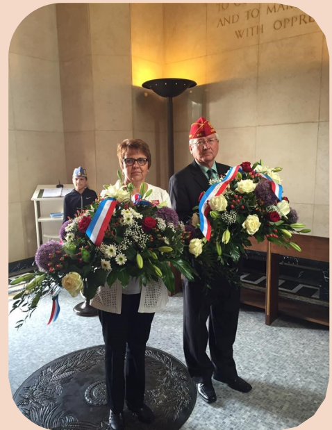
Laying Wreaths at the Luxembourg American Cemetery