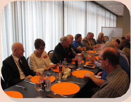
Luncheon at SHAPE Club