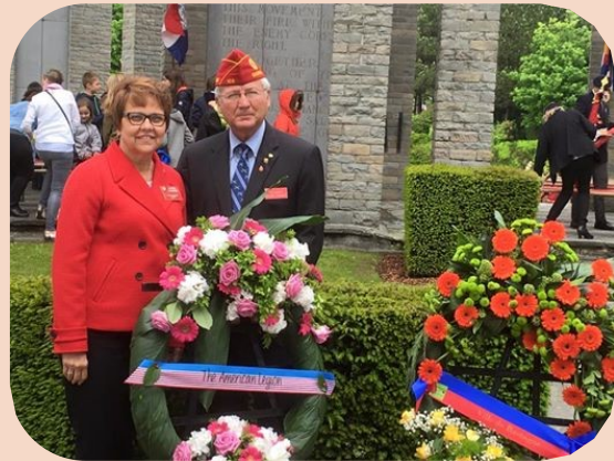
At the Bastogne Memorial Day Ceremony