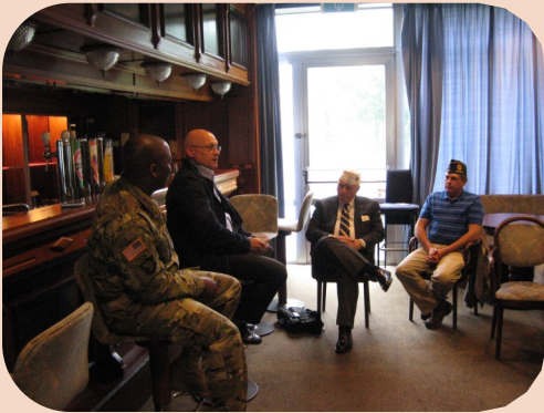
Command Briefing at SHAPE