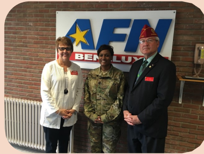
AFN Interview at SHAPE