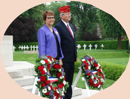
Flanders Field American Cemetery