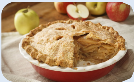
Apple Pie Contest