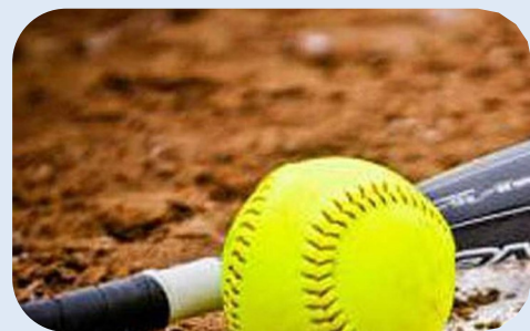
Softball Game—Americans vs Belgians