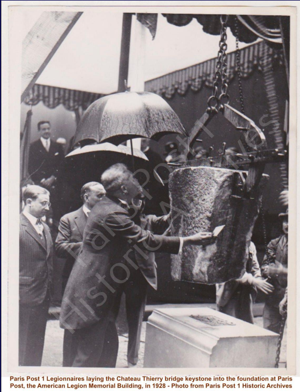
Paris Post 1 Legionnaires laying the Chateau Thierry bridge keystone into the foundation at Paris Post, the American Legion Memorial Building, in 1928

We truly appreciate the efforts of each and every person willing to share “hugs from home” and words of encouragement with those who have given so much.